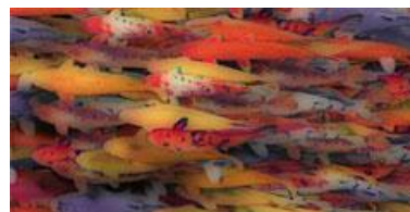
Link 3 video only