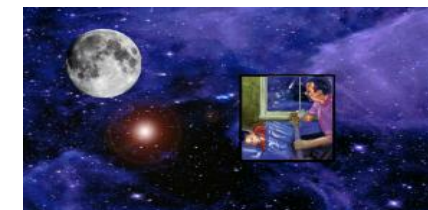
Link 2 audio & video