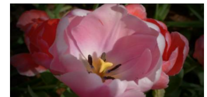
Link 5 audio & video