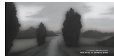
Link 4 audio & video