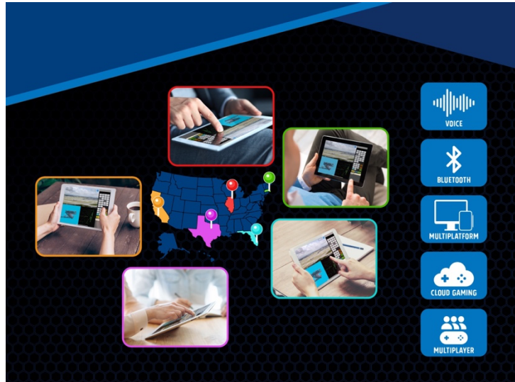
Multidevice Communication for On Demand

Talent acquisition and retention are increasingly critical to organizational and individual success. At the same time, training is changing in terms of how it is delivered and what media is used. The need to hire highly qualified personnel requires a Training Transformation in which current learning aligns with the prospective workforce’s generational knowledge acquisition differences. TransLumen’s experience has shown that as part of designing effective training, the student needs to be consistently engaged and tactically challenged. To improve student success (i.e., individuals with high levels of expertise), more technology and the right technology are required to accommodate the user’s appetite for visual content, interaction, and increased realism. Augmenting training/learning with technical microsimulation apps incorporating Artificial Intelligence (AI), residing on a development “gamified” platform, and delivered on cross-platform (including mobile) devices can drive critical applications. This game-based training promotes higher training scores, lower failure rates, and shorten the time to certification while reducing training costs.