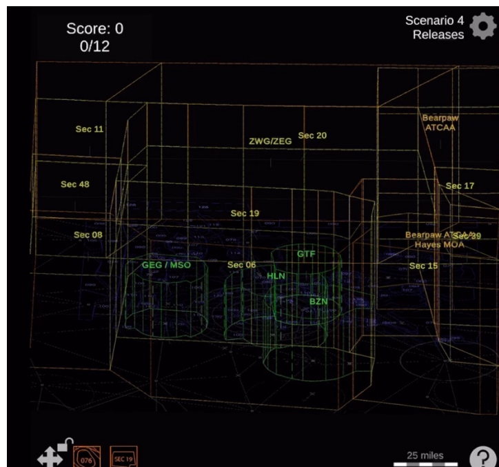
3D Airspace Under User Control

Environment realism was employed to represent relevant integrated airspace geospatial aspects more in tune with 3D reality. National Airspace System (NAS) boundaries, changes of controls, geography and other relevant geospatial variables are represented in the User Experience/ User Interface (UX/UI) design for Controller roles. TransLumen has the expertise to program the required physics for AI programming and geospatial data to be incorporated into the games for realistic gameplay and to maximize learning for use in actual operations.